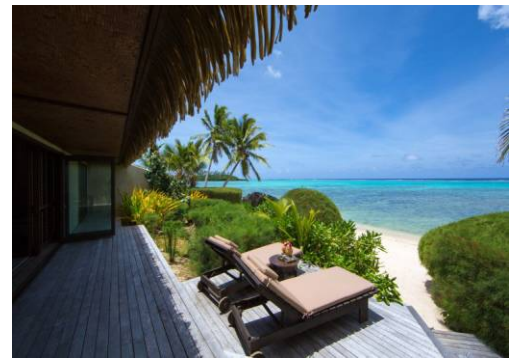
ULTIMATE BEACHFRONT VILLA