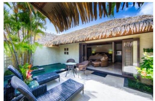
POOL VILLA SUITE