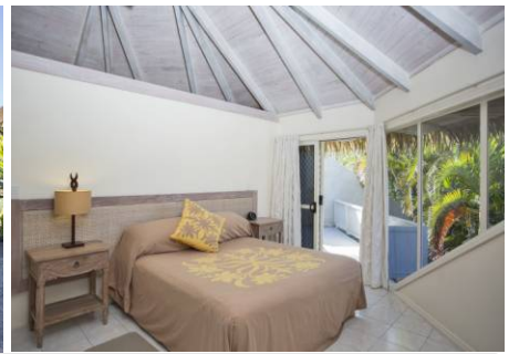
STANDARD POOL VILLA (3 BEDROOM)