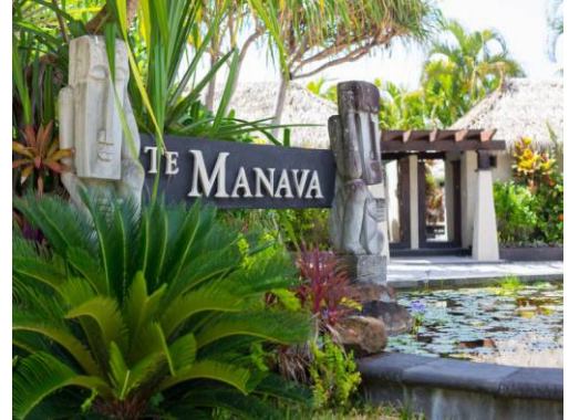
TE MANAVA LUXURY VILLAS & SPA

Te Manava Luxury Villas & Spa has been designed for travellers who appreciate nature's beautiful surroundings, independence and 5 star luxuriously appointed self-contained accommodation.