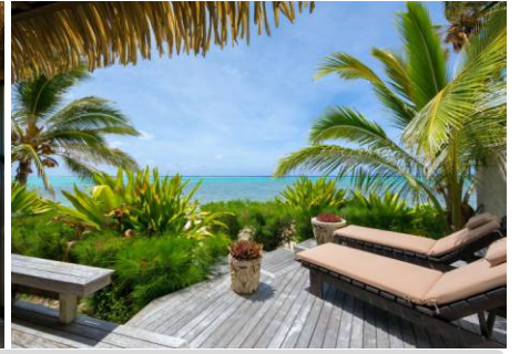
ULTIMATE BEACHFRONT VILLA (1 BEDROOM)