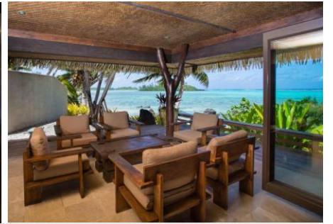
PRESIDENTIAL BEACHFRONT VILLA (3 BEDROOM)