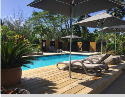
GUEST SWIMMING POOL