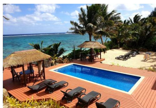
SWIMMING POOL & PICNIC AREA