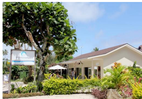
ENTRANCE TO MOANA SANDS VILLAS

Situated at the Villas is the Hibiscus Spa, which offers a range of beauty treatments, including a relaxing full body massage that will leave you feeling relaxed, refreshed and rejuvenated. The popular Coco Latte Café is adjacent to the property, with an outdoor dining area with covered picnic tables. The café has a great menu to take you from breakfast to lunch.