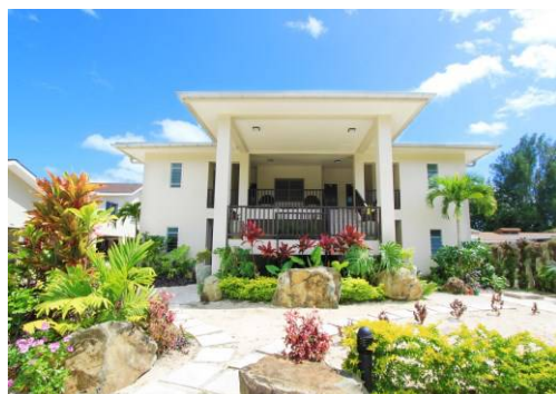
MOANA SANDS VILLAS