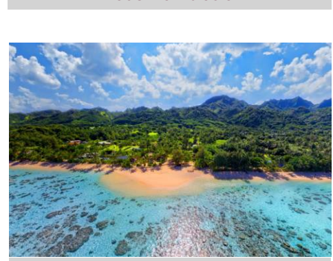
Stunning beachfront & lagoon

Daily tropical breakfast at onsite restaurant, free use of kayaks & snorkelling gear, beach chairs, beach towels, and use of guests' BBQ