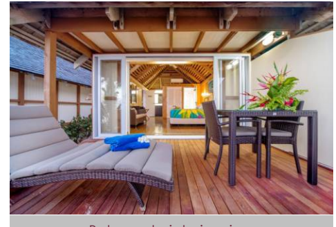
Balcony to interior view