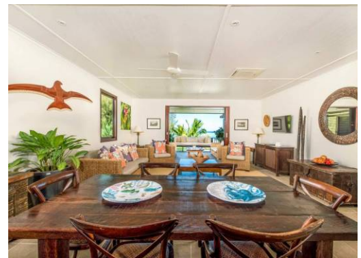
EXQUISITE POLYNESIAN DÉCOR