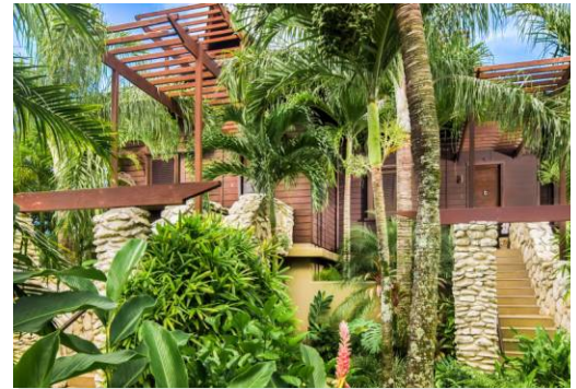
TE VAKAROA VILLAS

Te Vakaroa Villas is the ultimate choice for couples or adult families. Being centrally located, the villas offer easy access to outside conveniences such as restaurants, cafes, Muri Night Market, grocery stores, water sports activities and more.