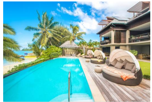
GREAT OUTDOOR RELAXATION