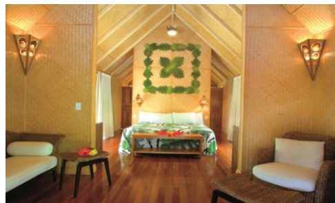
HONEYMOON POOL & SPA BUNGALOW