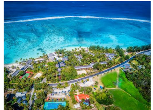
THE RAROTONGAN BEACH RESORT & LAGOONARIUM

Captain Andy's Beach Bar & Grill is located poolside with dining also available in the nearby lagoon front Blue Lagoon Marquee with epic lagoon views, perfect for a cocktail watching the sunset. Te Vaka Restaurant offers a long sweeping deck overlooking Aroa lagoon, the Lagoon of Love. Both restaurants offer outdoor and indoor dining areas. Breakfast is available daily 7-10am and guests can order delicious meals and drinks off the All Day Menu throughout the day.