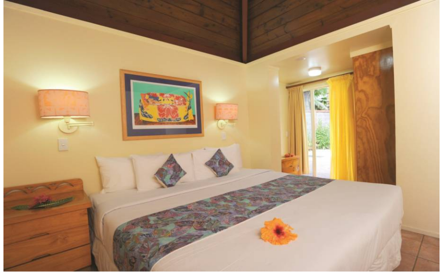
2 BEDROOM BEACHSIDE SUITE