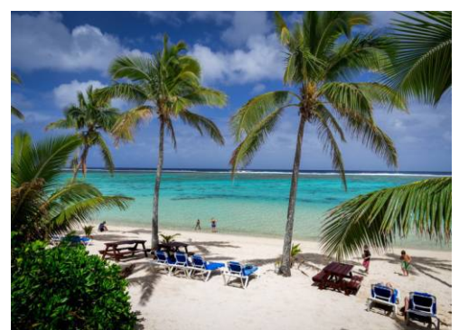
STUNNING BEACH & LAGOON