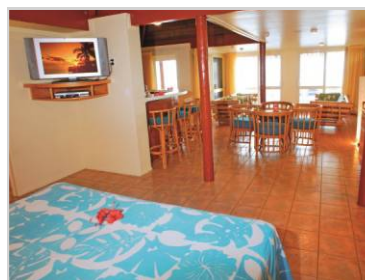
GRAND BEACHFRONT SUITE