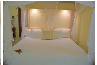
2 BEDROOM BEACHSIDE INTERCONNECTING FAMILY SUITE