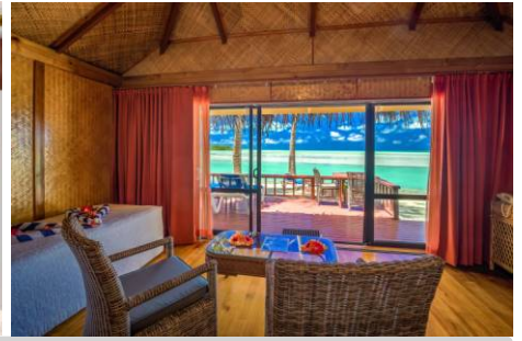
DELUXE BEACHFRONT BUNGALOW