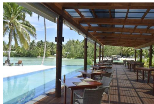
RELAX BY THE POOLSIDE WHILST ENJOYING THE LAGOON VIEW