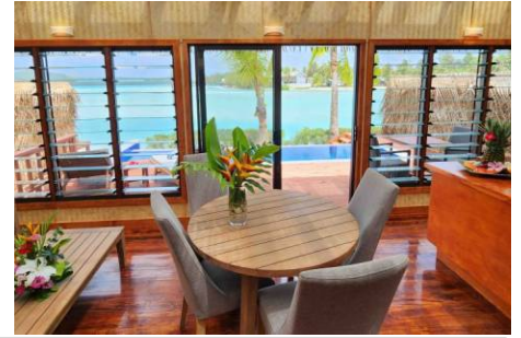
BEACHFRONT PRIVATE INFINITY POOL VILLA