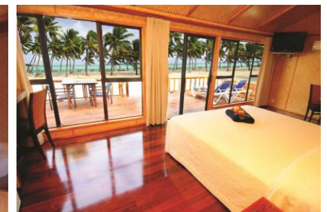
PREMIUM BEACHFRONT BUNGALOW