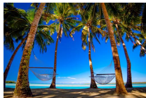
RELAX ON A HAMMOCK BY THE BEACH