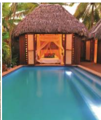
ROYAL HONEYMOON POOL VILLA (PRINCESS TE ARAU)