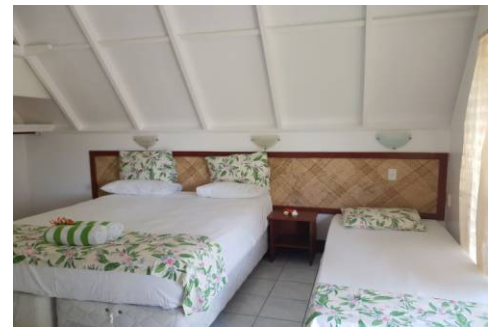
BEACHFRONT BUNGALOW INTERIOR