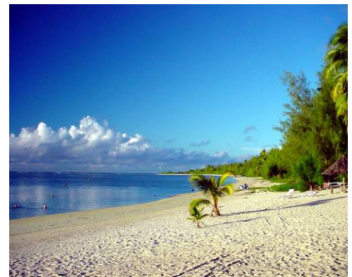
STUNNING LAGOON VIEW