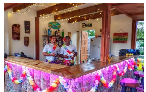
THE COVE BAR