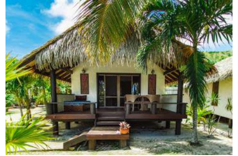
ONE BEDROOM BUNGALOW