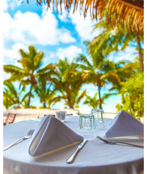
TAMANU RESTAURANT & BAR