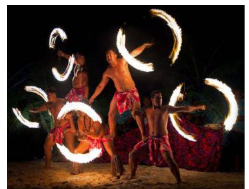
ISLAND NIGHT FIRE DANCE SHOW