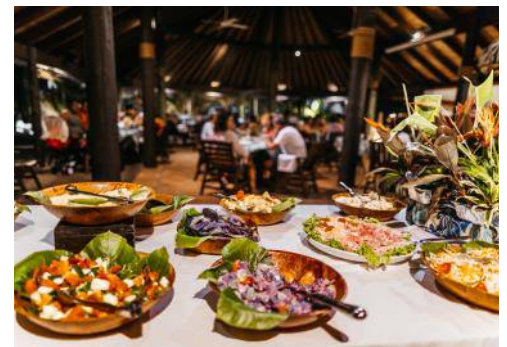
DINNER AT TAMANU RESTAURANT