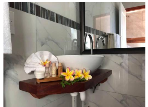
COMPLIMENTARY BATHROOM AMENITIES