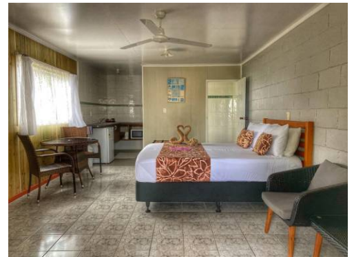
RINO'S BEACH BUNGALOWS