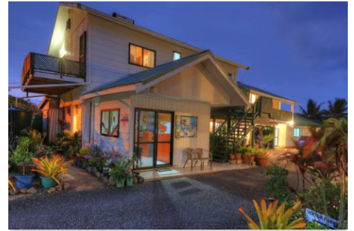
WELCOME TO RINO'S BEACH BUNGALOWS

Rino's Beach Bungalows has easy access to many outside conveniences, and is centrally located within walking distance to the township, Post Office, Banks and Central Market. It's a popular choice for not only families and lone travellers, but also for couples looking to escape their busy lives and to enjoy all that Aitutaki has to offer, from the warm tropical weather to the stunning lagoon.