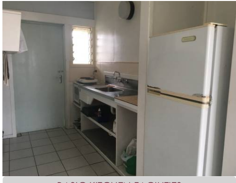
BASIC KITCHEN FACILITIES