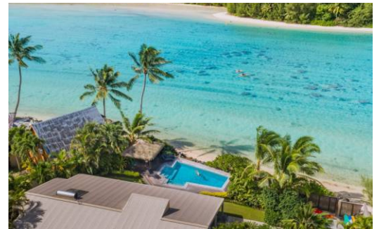
Muri Beach Villa awaits..

A fully equipped laundry opens to an outdoor covered carport at the rear of the Villa. The Villa requires a mandatory cleaning fee per stay. Stays of 7 nights or more receive a complimentary mid-stay maid service and linen change.