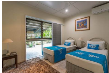
THIRD BEDROOM INTERIOR