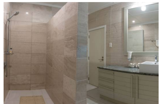
Stunning bathroom interior