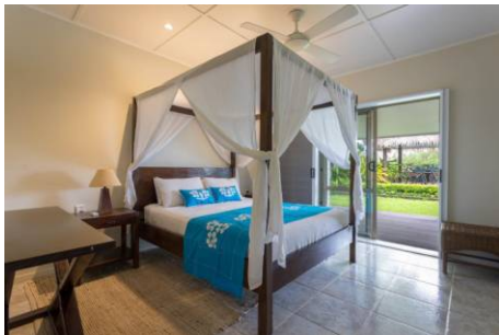
MASTER BEDROOM INTERIOR