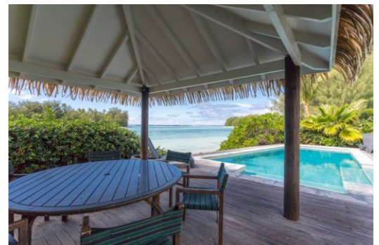
Your own private swimming pool