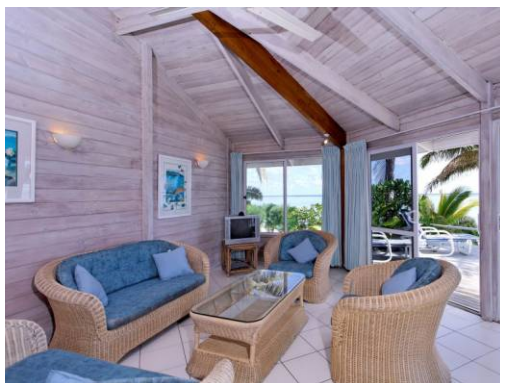
SPACIOUS LOUNGE AREA