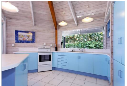
LARGE KITCHEN AREA