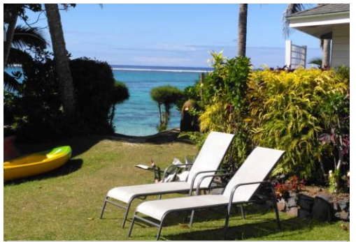
RELAX, UNWIND & REJUVINATE