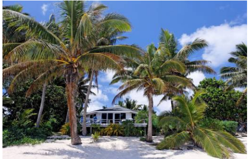
SANDS VILLAS ON THE BEACH

Sands Villas is an excellent holiday destination for small families or groups of friends looking to escape their busy lives and relax in luxury South Pacific ambience.