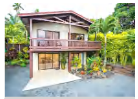
LAGOON VIEW EXECUTIVE VILLA