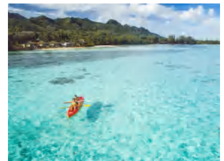
ENJOY KAYAKING IN THE LAGOON