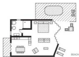
1 BEDROOM BEACHFRONT VILLA (VILLA 1 & 3)