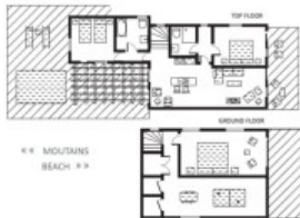
2 & 3 BEDROOM LAGOON VIEW EXECUTIVE VILLAS