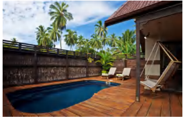
LAGOON VIEW VILLAS