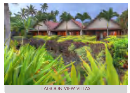
LAGOON VIEW VILLAS