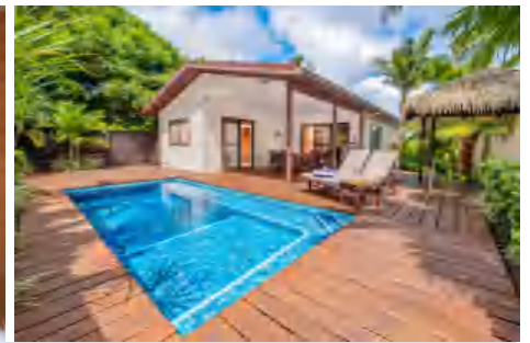
LAGOON VIEW EXECUTIVE VILLAS