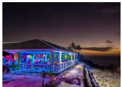
TIKI TERRACE AT NIGHT