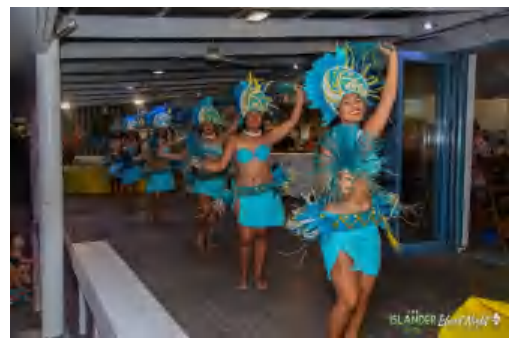
SPECTACULAR ISLAND NIGHT SHOW