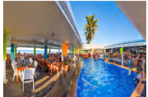
THE ISLANDER HOTEL

The Islander Hotel is recognized as Rarotonga's most "island styled" property and certainly portrays a slice of culture and service of the people of the Cook Islands. It caters well for holidaymakers, travellers en-route to the outer islands and for the discerning business travellers.