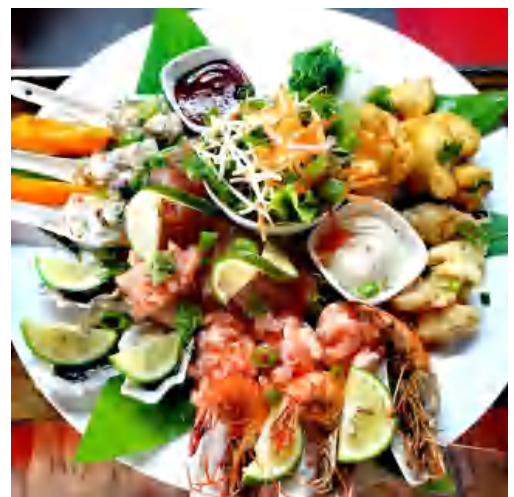
EXQUISITE MEALS SERVED AT THE ISLANDER RESTAURANT