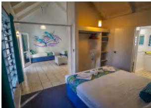
GARDEN VIEW ROOM