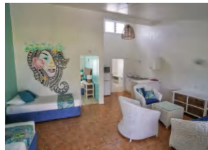
POOL VIEW ROOM