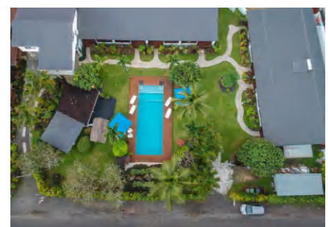
Aerial shot of the property