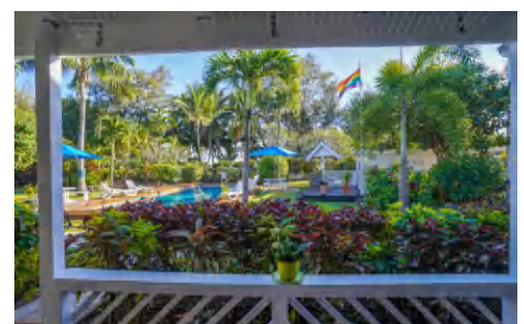
Swimming Pool from Cabana 6