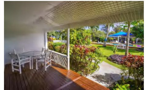
Cabana Room Exterior

Next door to the property is Kavera Central, where you can find a take-away, and convenient store with a petrol station. Directly across the road is a long stretch of white sandy beach and blue lagoon, perfect for snorkelling, a stroll or to watch the stunning evening sunsets.