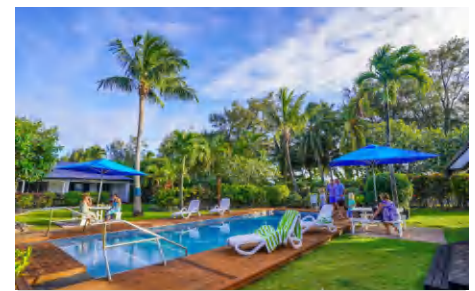
By the Pool