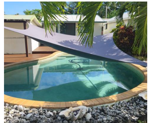
SWIMMING POOL OVERLOOKING THE LAGOON