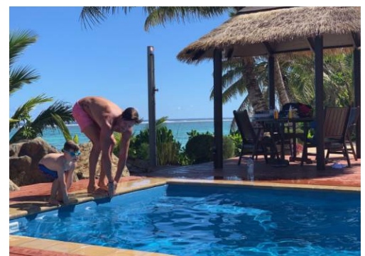
ENJOY A DAY OUT IN THE POOL