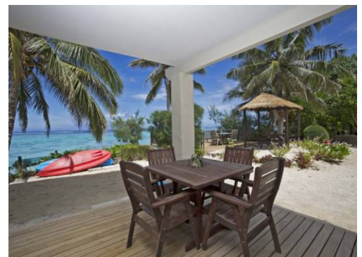
OUTDOOR BEACH DECK