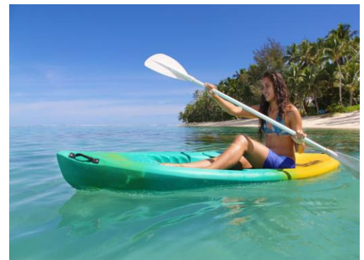
EXPLORE THE LAGOON ON A KAYAK