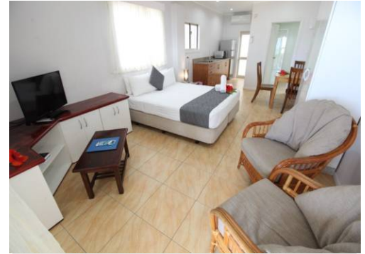
BEACHFRONT APRTMENT (STUDIO)

Moana Sands Apartments offer great value for money accommodation, coupled with the excellent location and stunning lagoon.