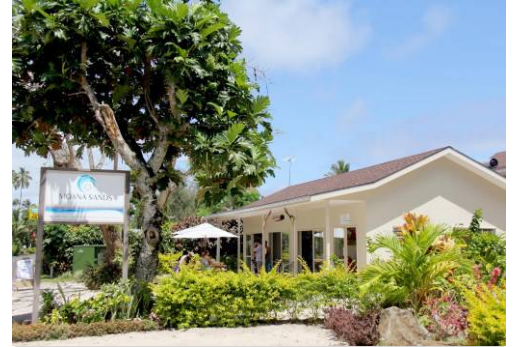
ENTRANCE TO MOANA SANDS VILLAS

Situated at the Villas is the Hibiscus Spa, which offers a range of beauty treatments, including a relaxing full body massage that will leave you feeling relaxed, refreshed and rejuvenated. The popular Golden Circle Café is adjacent to the property, with an outdoor dining area with covered picnic tables. The café has a great menu to take you from breakfast to lunch.