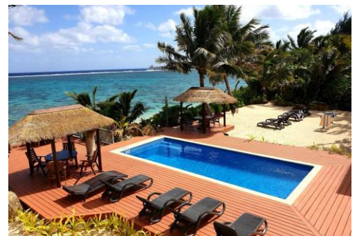
SWIMMING POOL & PICNIC AREA