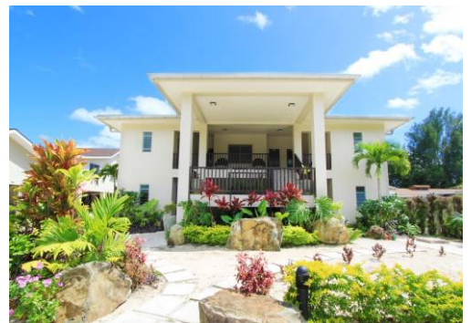
MOANA SANDS VILLAS