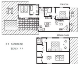
LAGOON VIEW EXECUTIVE VILLAS—2 & 3 BEDROOM