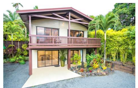
LAGOON VIEW EXECUTIVE VILLA