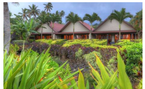
LAGOON VIEW VILLAS