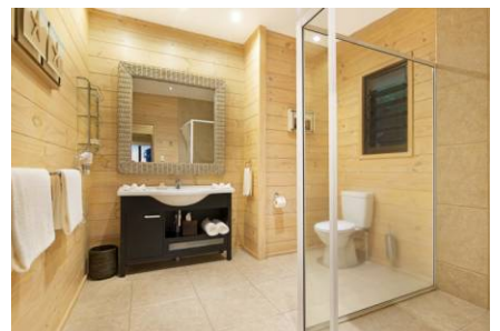
LAGOON VIEW EXECUTIVE VILLA