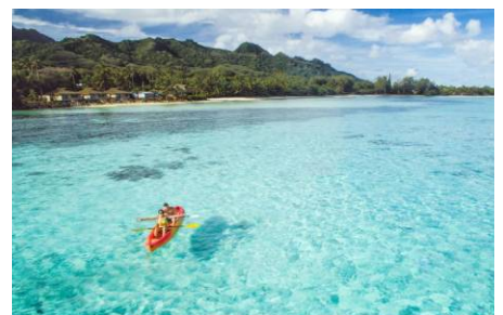
ENJOY KAYAKING IN THE LAGOON