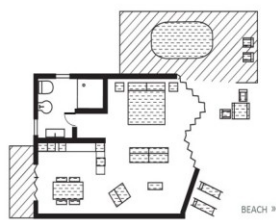
BEACHFRONT VILLA—1 BEDROOM