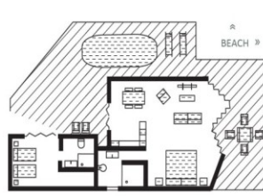
BEACHFRONT VILLA—2 BEDROOM