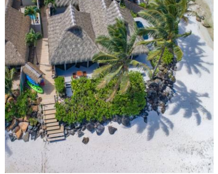
SEA CHANGE VILLAS FACILITIES