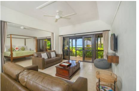
LAGOON VIEW VILLA