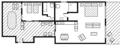
LAGOON VIEW VILLA—2 BEDROOM