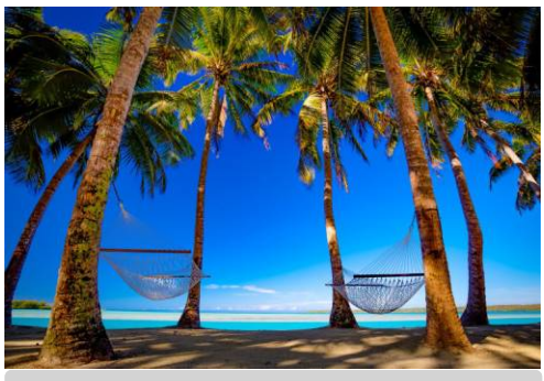
RELAX ON A HAMMOCK BY THE BEACH