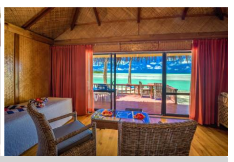
DELUXE BEACHFRONT BUNGALOW