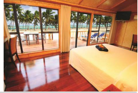
PREMIUM BEACHFRONT BUNGALOW