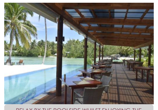
RELAX BY THE POOLSIDE WHILST ENJOYING THE LAGOON VIEW