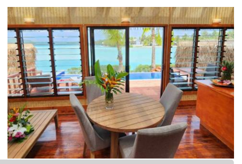
BEACHFRONT PRIVATE INFINITY POOL VILLA